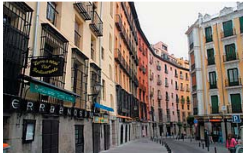
Barrio de Asturias

On the southern side of Puerta del Sol, and centered around the Plaza Santa Ana. This is a major going out area for a wide mix of people. It has a good combination of tapas bars and bares de copas . The famous Café Central for listening to jazz music is in the Plaza del Ángel, 10 (metro Sol or Antón Martín).