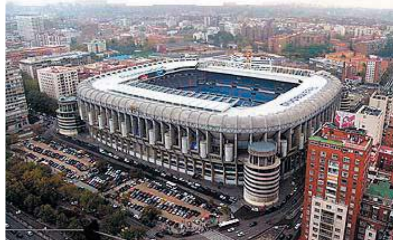
From top: Torres KIO Estadio Santiago Bernabéu