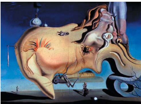
From top/left: Sorolla Goya Dalí

art features Dalí , Picasso and Miró among many other greats. The shop is worth a visit as well as the building, which is a reconstructed hospital with a central garden for strolls. They have interesting expositions and free concerts. This museum completes the “Arts Triangle” along with the Prado and the Thyssen.