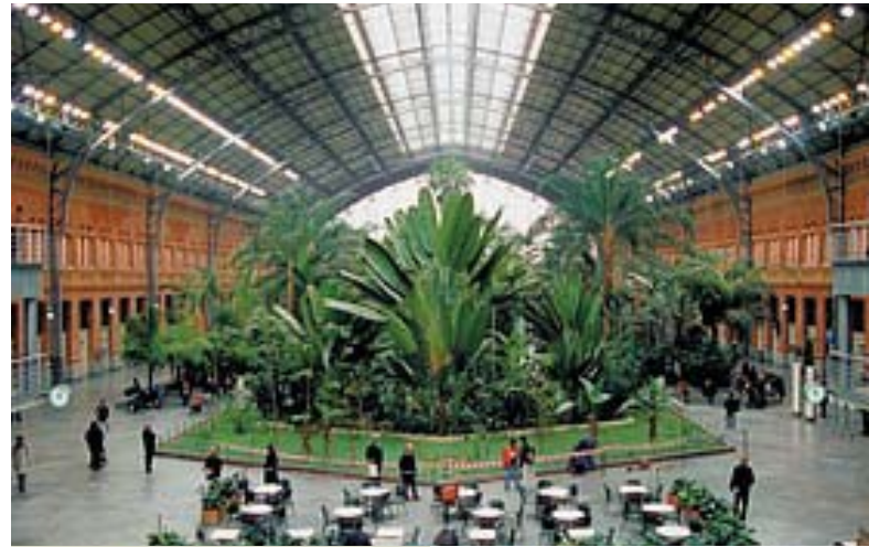
Atocha (Train station)

The old part of Madrid is fairly small and most things are within walking distance once you are in the center, but you have got to know how to find them! Here are some useful things to help you orient yourself and get things done.