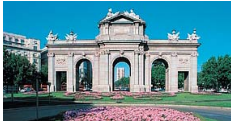
Left: Botanical Gardens Right: Puerta de Alcalá

as an arsenal during the wars against Napoleon , it became Madrid's Museum of Art in 1819 to house the king's painting collection.